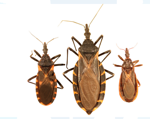
"Kissing bugs", three Triatoma species common in the southern United States

In N. America, dogs acquire American trypanosomiasis after eating (or having contact with) feces from an infected kissing bug. The bug is infected by feeding on the blood of an infected animal or person. Dogs may also be infected through blood from another dog (e.g. transfusion or puppies from an infected dam through placental spread) or potentially eating tissues of infected animals (e.g. wildlife).